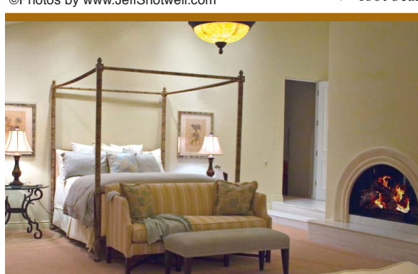
The master suite is comprised of four individual rooms.

"The property is unique in that it can just as easily be used to entertain 500 as serve as a family compound or retreat. The estate's historical significance was respected throughout the restoration. Its rich history and role in Hollywood's Golden Era can't be measured.