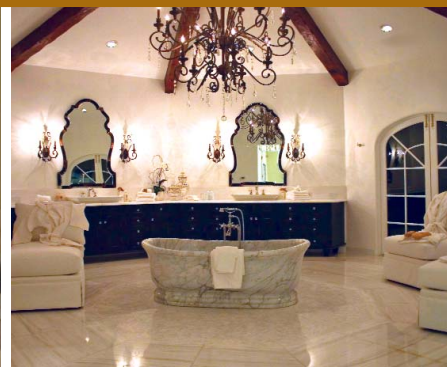
The Carerra marble bath takes center stage in the