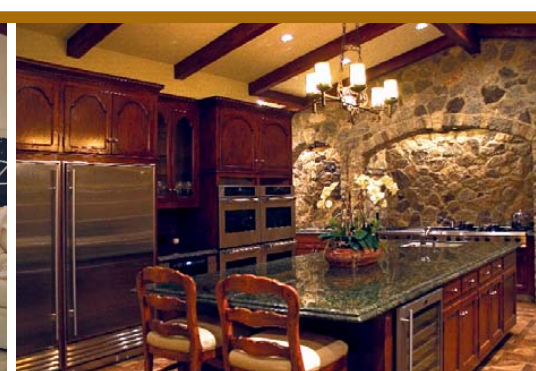
A 14-burner Viking™ stove complements four ovens in the grand kitchen.